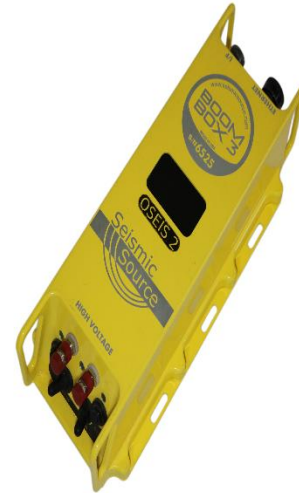
Boom Box 3 unit

A built in Wi-Fi unit allows all of the data to be viewed and saved on a small notepad tablet or even a cell phone. This allows critical redundant storage of the shot time (micro second accuracy), up-hole times, and GPS position of the shot. The Boom Box 3 Autonomous unit includes a standard Boom Box 3 plus a removable battery pack with built in GPS and an additional “Safety” fire button. This package provides a complete, compact, light- weight and rugged blaster unit.